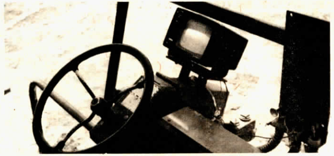
Tractor or combine TV monitor gives panoramic rear view.

For more information, contact: FARM SHOW Followup, Bruce W. Johnson, Rt. 5, Box 204-I, Raleigh, N.C. 27604 (ph 919 266-0309).