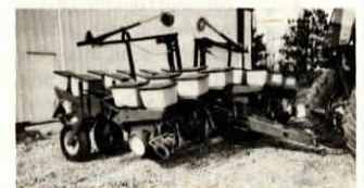
Kelderman's new planter kit folds outside rows forward.

The fold kit lets you fold or unfold the planter without getting off the tractor. On a 12-row planter, the three outside rows on either side fold around to the front side, pulled forward by a single cylinder on each side. The company has also just introduced a hydraulic bi-fold marker system that'll automatically fold markers on Deere Max-Emerge planters to a storage height of about 8½ ft.