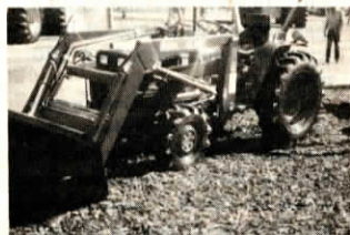
Kioti tractor can be fitted with heavy-duty loader.

The tractor features easy servicing. Fuel tank, oil dipstick, radiator and air cleaner are all easy to get at under a lift-up hood. Comes with complete service tool kit and sells for $6,995.