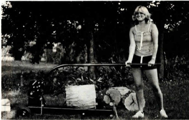
Pressure applied to hand-splitter's handle is multiplied 60 times.