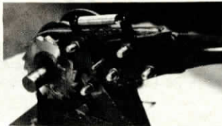
Photo details ratchet design which lets operator increase down pressure by raising the handle a notch or two.

According to Schroeder, the splitter works on a 60 to 1 ratio so 200 lbs.