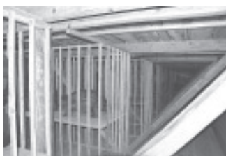
Life-size polyester elephants peek over rails (right), and there are other assorted animals scattered throughout the ark in cages (above). Huiber built the ark on a barge so that it can be moved by tugboat to various sites in Holland and eventually to other countries.