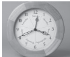
A second model shows both the time and the day.