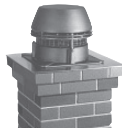
Fan mounts on top of chimney to pull smoke upward.

Contact: FARM SHOW Followup, EXHAUSTO, Inc., 1200 Northmeadow Parkway, Suite 180, Roswell, Georgia 30076 (ph 800 255-2923; info@exhausto.com; www.chimneyfans.com).