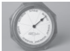
Clock is divided in seven segments for each day of the week.