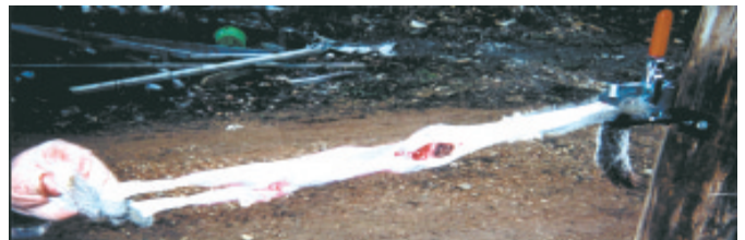
Metal bracket bolts to a tree or post or can be held in a bench vise. Built-in toggle clamp holds one end of squirrel in place.

Contact: FARM SHOW Followup, Barkclad Natural Products, 217 Bethel Drive, Canton, N.C. 28716 (ph 828 648-6092; toll free 877 648-2275; fax 828 648-9028; barkclad@bellsouth.net; www.barkclad.com).