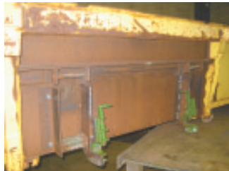
On the header's rear opening, he installed brackets that fit his Deere 740 front-end loader.

"I also mounted wear skids on the bottom so it doesn't dig into unfrozen ground. On the front edge I mounted a heavy-duty steel beveled cutting edge. I bolted to existing holes that were already in there for attaching the guards," he explains. "On the rear opening, I installed a plate with attaching bracket