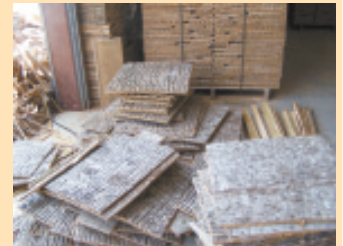
Poplar bark siding can also be used to panel interior rooms.

Like a pig farmer selling everything but the squeal, Barkclad sells a wide variety of