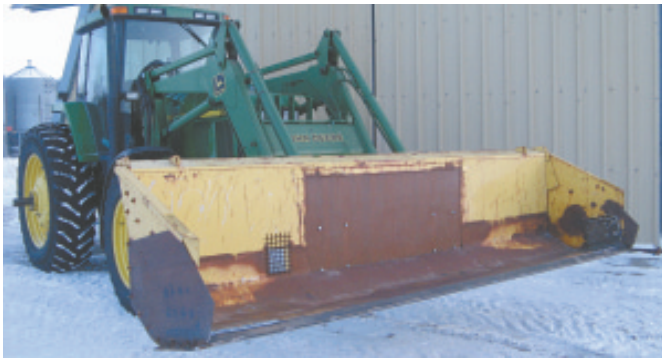
Roger Gutschmidt built this heavy duty snow bucket out of a New Holland 960 header.