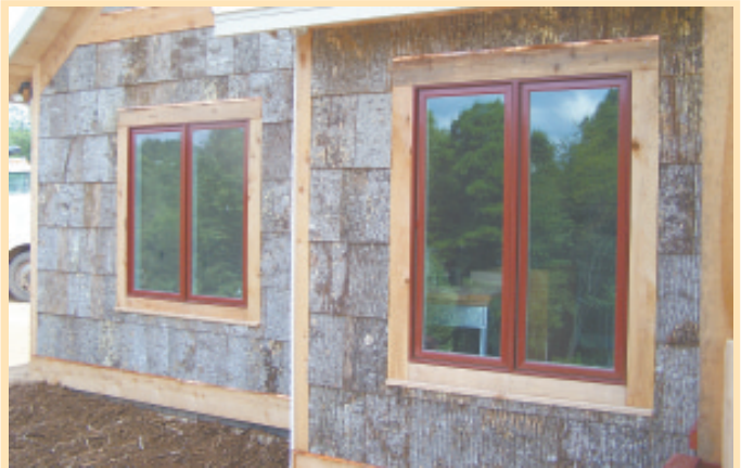
A North Carolina company sells poplar bark siding made from Tulip Poplar trees harvested in the Appalachian Mountains.

Contact: FARM SHOW Followup, Semmel Enterprises, Inc., 3268 South 31st St., Lincoln, Neb. 68502 (ph 402 730-4590; semmelentvp@aol.com; www.monsterballvise.com).