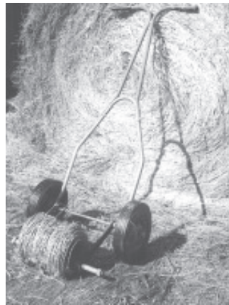
Barbed wire unroller carries roll off the ground to keep wire from tangling.

Contact: FARM SHOW Followup, Fire Fight Fire Extinguishers, Division of Global Aerotech, Inc. C-7, 2885 Electronics Dr., Melbourne, Fla. 32935 (ph 321 752-9096; Ralphnio@bellsouth.net; www.FireFight1.com).