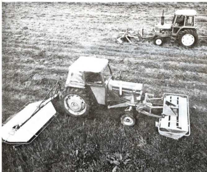
Front-mounted 3 pt. hitch, with optional pto, allows one tractor to windrow and bale, cut and condition, cut and spread hay, or to gang mowers.