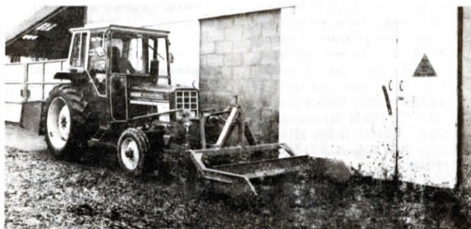
Front-mounted, hydraulic-driven pto has self-contained power operated clutch. Gear pump mounted on gearbox provides fixed oil flow at 100 psi to clutch actuating piston.