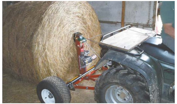
Close-coupled wheeled carrier puts minimal weight on ATV's suspension system.