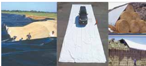
Customers continually come up with new uses for the heavy-duty tarps.