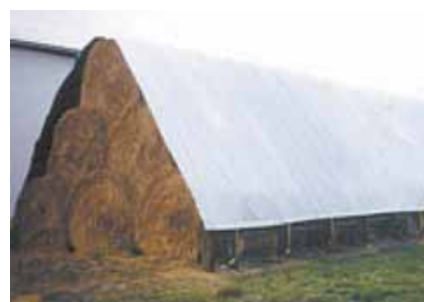
Tarps have channels on all four sides for pipe, cable or rope. Billboard vinyl is anti-mildew, anti-UV, and waterproof.

“Due to the high quality of the material, these vinyl tarps originally cost about $600 to $3,000 to manufacture, depending on the size. We sell them for only a fraction of that cost. Nobody can beat our prices. Also, by re-using this material, you can lower your carbon footprint by eliminating additional energy needed for manufacturing new product. You also lower the harmful emissions associated with it. It’s great to find alternative uses for the material instead of throwing them into a landfill. It is a win for the customer and a win for the environment.”