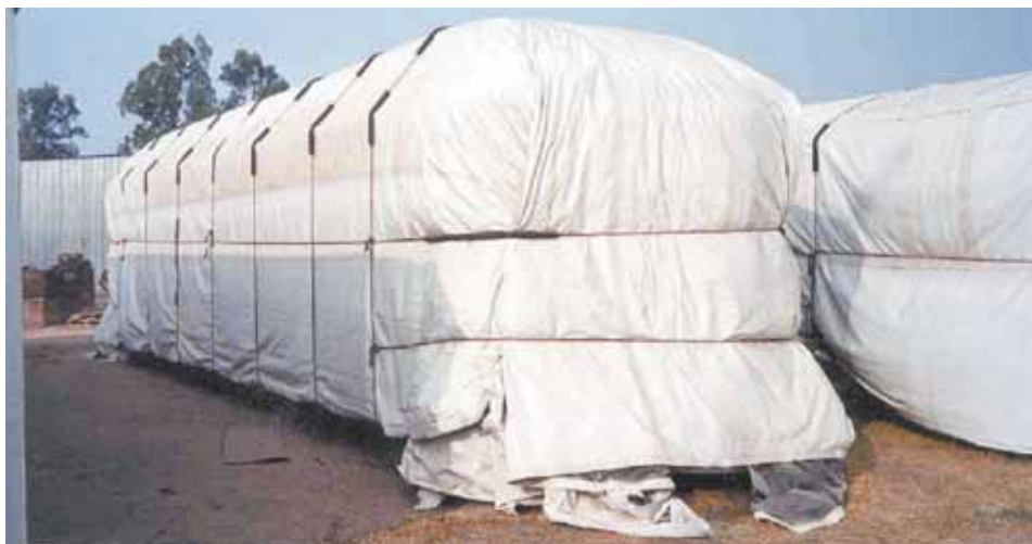
Industrial-strength billboard tarps can be used for everything from covering hay piles to protecting equipment and even lining farm ponds. Get more info at www.BillboardTarps.com .

All of the tarps have 3-in. channels that run along all four sides so you can insert pipe, cable or rope to fasten them down. McConville also says that since the pieces have channels, there are no grommets needed. However, you can easily add them with a grommet kit from your local hardware store.