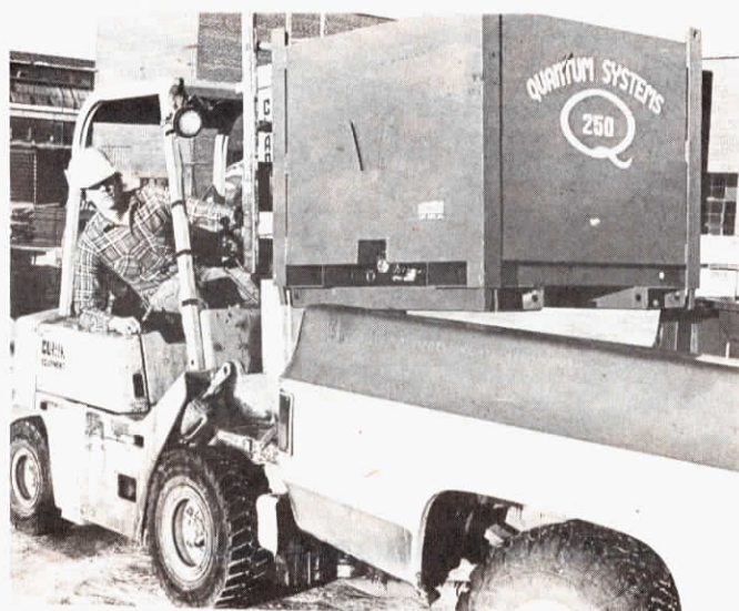
Quantum System containers are 43 in. square and fit easily into pickup.

For more information, contact: FARM SHOW Followup, Weil Service Products Corp., 2434 West Fletcher St., Chicago, Ill. 60618 (ph 312 528-6800).