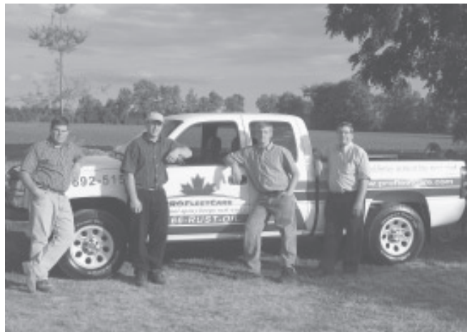
Pro-Fleet Care operators travel to farms to spray a special blend of rust prevention chemicals onto vehicles and equipment.

The investment required to become a franchise operator is in the $30,000 to $60,000 (Can.) range. In addition to a turnkey equipment package, this fee guarantees a variety of benefits, including assistance in establishing a client base, two weeks of intensive training, ongoing support, and exclusive protected territories. It also includes a custom accounting and business package, with three months of book keeping.