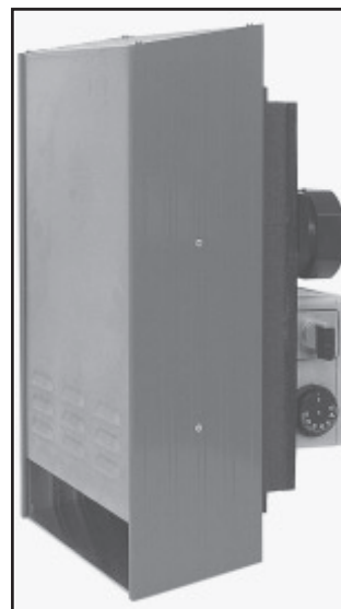
This drying unit installs at one end of kiln.

Contact: FARM SHOW Followup, Logosol Inc., P.O. Box 660, Madison, Miss. 39130 (ph 601 856-1889 or 877 564-6765; info@logosol.com; www.logosol.com).