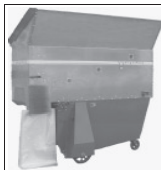
Weaverline mulch bagger is ideal for bagging peat and composted manure. Many customers sell directly from the farm. The bagger holds 2 1/4 cubic yards, enough to bag about 30 2-cubic foot bags.

Contact: FARM SHOW Followup, Weaverline Corporation, 180 Boot Jack Rd., Narvon, Penn. 17555 (ph 877 464-1025).