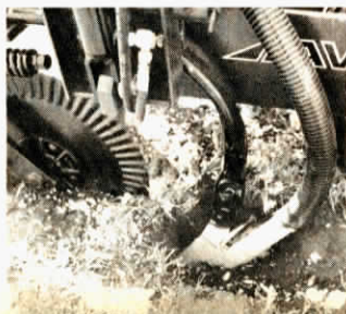
Turbo-Flo deep places dry fertilizer 6 to 9 in. deep, and at rates from 8 to 2,000 lbs. per acre.

"This tag-along system makes deep placement of dry fertilizer available to all corn growers, regardless of what kind of planter they now own," Long notes. "If you want the Turbo-