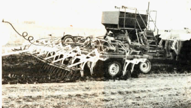
With Turbo-Flo, dry fertilizer can be "deep placed" with anhydrous, and in conjunction with the tillage operation.