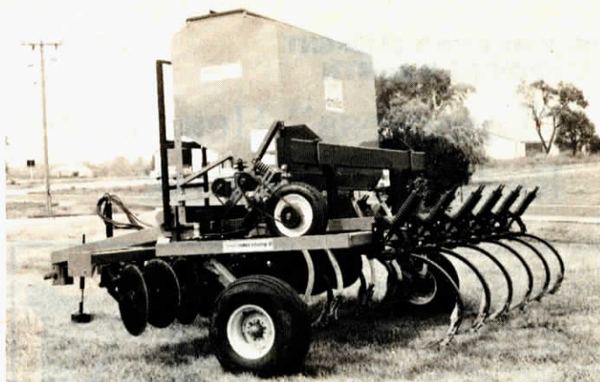
Ground-drive "Dri-Flo" from DMI uses gravity flow to "deep place" dry fertilizer.

placement of liquid or anhydrous fertilizer, along with granular, is also possible with the Dri-Flo, which sells for about $3,800. The hopper (44 by 90 by 60 in. deep) holds 7,000 lbs.