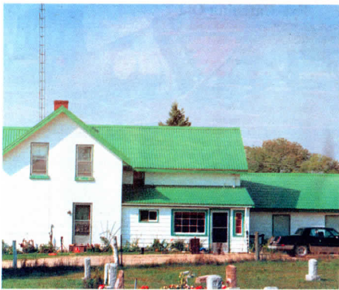
New roofing has the charm and beauty of expensive roofing made from individual clay tiles laid side by side, but is actually made from steel sheeting.