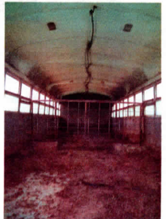
Sprinkler system attached to ceiling keeps hogs cool in summer.

Beskau made a second school bus hog hauler that's used to haul feeder pigs back and forth between farms scattered several