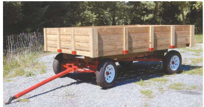
He uses the wagon to give hay rides to his grandchildren “and to any adults who want to relive their youth”.

A pair of 6-in. sq., 8-ft. long wooden beams