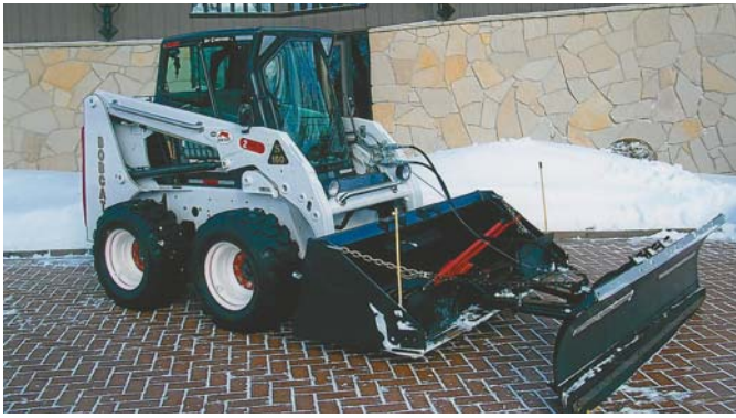
Oscillating bucket mount plow has a heavy rubber cutting edge, allowing you to use a skid loader for snow removal “without leaving a scratch”.