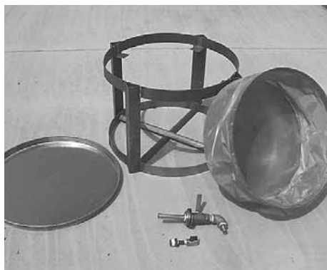
System filters particles greater than .002 out of the oil.

heater under the inlet screen of the reservoir heater. This should warm the vegetable oil in the heater tank enough to run through the heater. Depending on the temperature and the size of the room and the heater, it will warm the vegetable oil in the tank back to a fluid state.