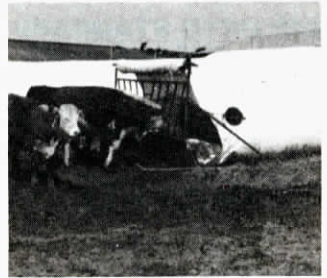
Bag rolls up on rollers at top and bottom of self-feeder.

For more information, contact: FARM SHOW Followup, Hart-Carter Co., 1501 1st Ave., Mendota, Ill. 61342 (ph 815 539-9371).