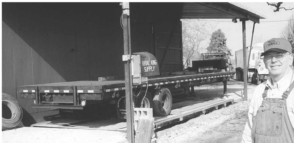
Mark Musser used the bed from a 35-ft. semi trailer as the platform for his home-built weigh scale. He installed four load cells under it, one at each corner.

The platform is covered with 3 by 12 bridge planks, which add strength and spread out the truck’s weight across a wider area. Musser used salvaged metal to make a roof