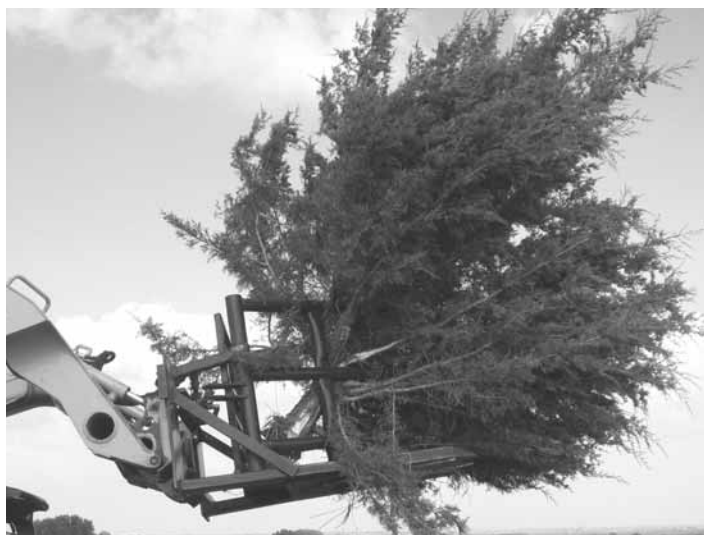
“V” Cutter allows you to cut trees and then haul them away thanks to its grapple arms.

Contact: FARM SHOW Followup, Mark Musser, 2361 E. 1950 Ave., Beecher City, Ill. 62414 (ph 618 487-5837).