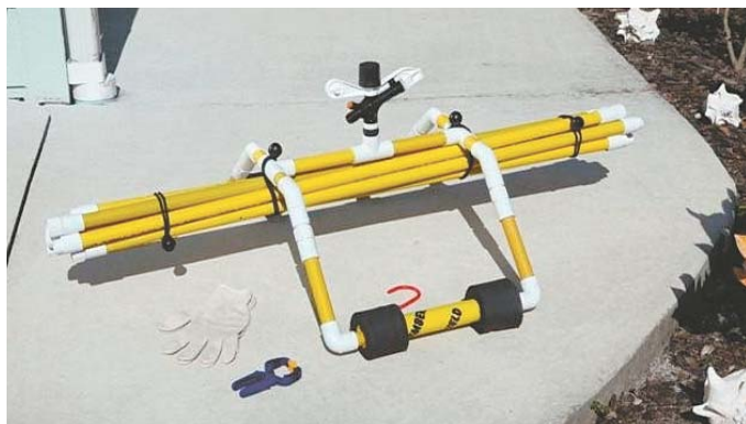
System comes with 4-ft. lengths of feeder pipe that connect together and run to the roof edge, where pipe hooks up to a garden hose.

Sells for $189.88 including S&H. Contact: FARM SHOW Followup, Eric R. Olson, P.O. Box 593256, Orlando, Fla. 32859 (ph 407 592-3242; info@rooftopfiredefense.com; www.rooftopfiredefense.com).