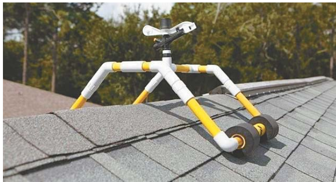
Rooftop fire defense system comes with a sprinkler head on top, and a pair of sponge-type rollers on each side that grip the roof.