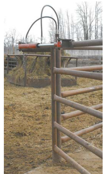
Squeeze chute operator uses valves to open or close hydraulic gates on 4 different pens. Each gate has a 2 by 20-in. hydraulic cylinder mounted at the corner.