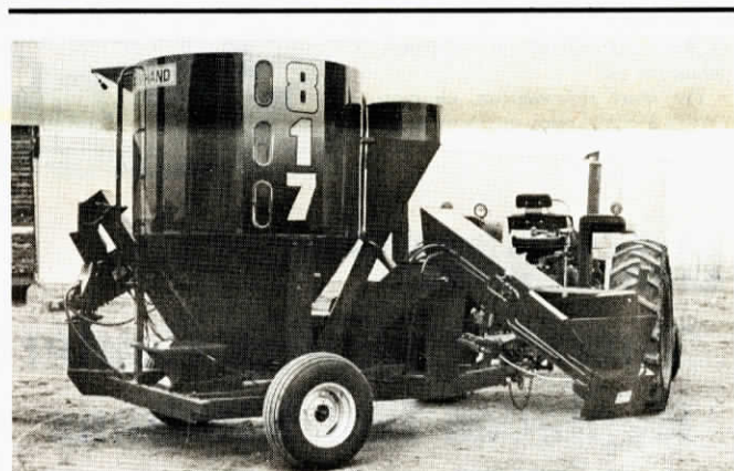
Farmhand grinder/mixer features a 250 bu./hr. sheller attachment.

Contact: FARM SHOW Followup, Haban Mfg. Co., 2100 Northwestern Ave., Racine, Wis. 53404 (ph 414 637-8388).