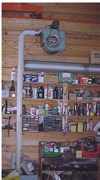
Shop pit has recessed lighting and a ventilation system made from PVC pipe and an old furnace fan. "It sure beats laying on a roller under a jacked-up vehicle," says Larry Brown.

Machinist vise mounts on a floating steel plate attached to a threaded rod. Vise holds a high speed, air-powered die grinder that Delisle used to recondition crankshaft splines.