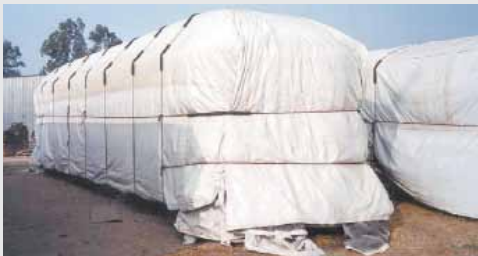
Industrial-strength billboard tarps can be used for everything from covering hay piles to protecting equipment and even lining farm ponds. Get more info at www.BillboardTarps.com .

All of the tarps have 3-in. channels that run along all four sides so you can insert pipe, cable or rope to fasten them down. McConville also says that since the pieces have channels, there are no grommets needed. However, you can easily add them with a grommet kit from your local hardware store.