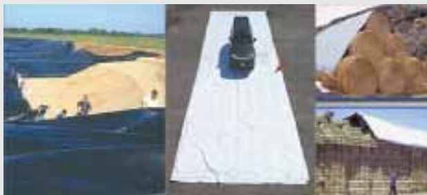
Customers continually come up with new uses for the heavy-duty tarps.