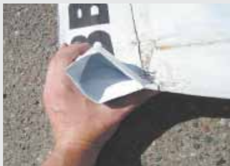
Tarps have channels on all four sides for pipe, cable or rope. Billboard vinyl is anti-mildew, anti-UV, and waterproof.