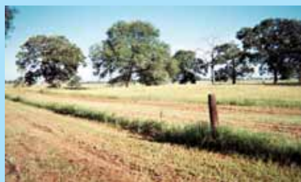
Fence line before cutting