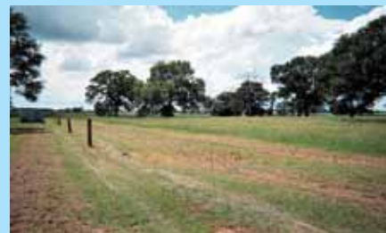
Fence line after cutting

The Fence Mower is a heavily-constructed tractor implement that mows under fence lines and maneuvers around fence posts as the operator drives parallel to the fence row.