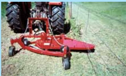
FM 60 Fence Mower