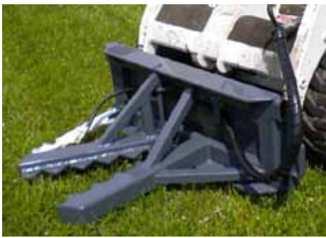
New: TreePuller Timberline Tree & Post Puller