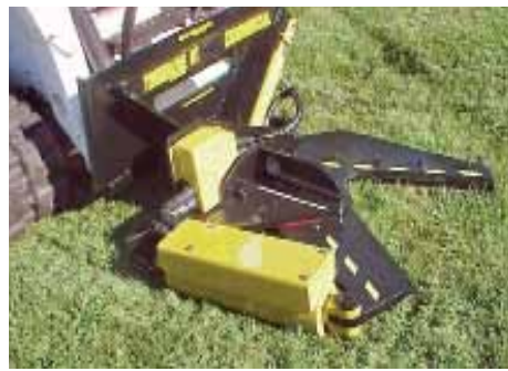
Model HTC-14 can cut a 14-in. tree at ground level in 5.5 seconds. All major pivot points are machined and greaseable for long life.