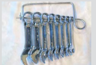
Spring-loaded wrench holder keeps a whole set of box end wrenches together.

The patent pending "Tool Keep" is available in 6 and 8-in. lengths that sell for $8 and $10 respectively. They're made out of high tensile stainless steel so they will not bend or rust.