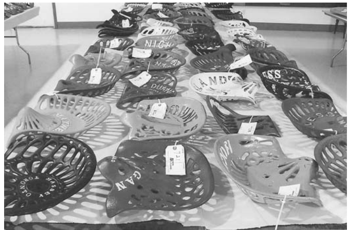
Charolette Traxler and her husband, Gordy, have a collection of dozens of old cast iron implement seats.

Seats like these have sold for as much as $2,500 in recent years. Some members like to paint their seats in a whimsical fashion to coincide with a variety of holidays or whatever suits their fancy. Sometimes the paint job costs more than that cast iron seat.