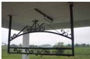
Two steel ends support four clotheslines kept taut by a turnbuckle.

Contact: FARM SHOW Followup, Larry Miller, L&C Welding LLC, 11705 W. 300 S., Shipshewana, Ind. 46565 (ph 260 593-0025).