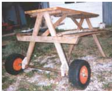
Removable wheels at one end of picnic table make it easy to move around.

Contact: FARM SHOW Followup, Robert Daniel Lindamood, 199 Clark Hollow Rd., Whitleyville, Tenn. 38588 (ph 615 699-2192).