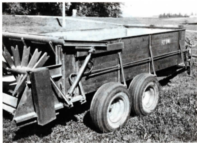
Heart of the "apronless" Orbilt spreader is the hydraulically-operated pusher which works in conjunction with the false front endgate. They move together as one unit to the rear of the box.