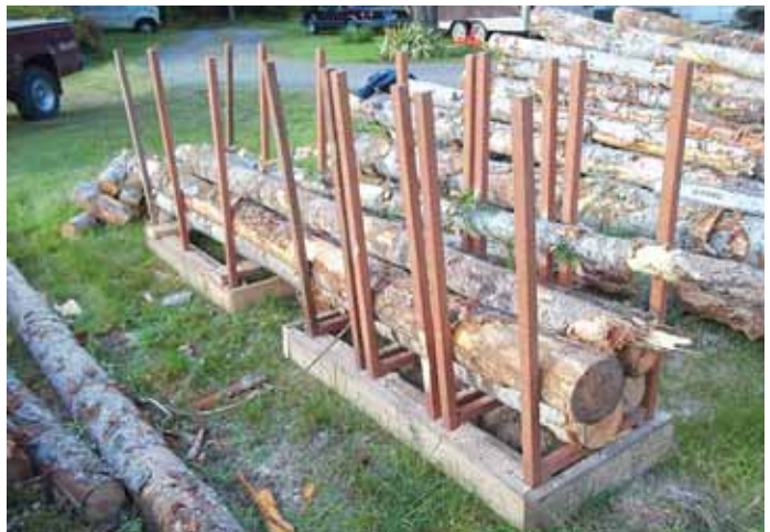
Rack is made from 2 by 6's and 2 by 2's. The 4-ft. uprights slide into pockets and are spaced to provide a uniform length of firewood.

Contact: FARM SHOW Followup, Tom Lundgren, 12055 Topaz Lane S.E., Olalla, Wash. 98359 (ph 253 301-7107; olalla33@yahoo.com).