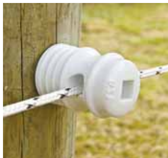
Insulator is made of super strong plastic that looks like porcelain. It comes with an adaptor on top that lets you use a cordless drill to screw it into wood fence posts.