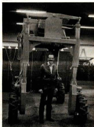
"Tree Goat's" platform is 7½ ft. off the ground.