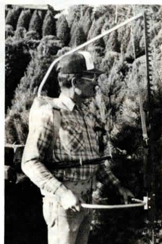
Operator controls back-mount tree shearer with waist-high handle.

"We're developing hydraulic-driven spray, mowing, shearing, cutting, and stand-up baling equipment for it. We plan to mount 3-pt. hitches on individual legs for between-row work," says Howe, noting that automation is increasing in the Christmas tree growing business due to increased competition. "There are so many trees expected to flood the market in the next few years that only those growers who automate will