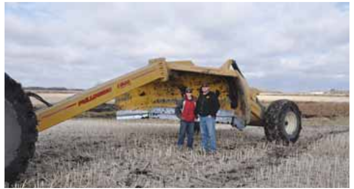
The Pulldozer works great for filling in potholes and leveling fields. It can also be tilted to dig new ditches or clean out existing ones.

The Pulldozer comes in four models. An 18-ft. model weighs 18,000 lbs., drags up to 18 cubic yards, and sells for $58,000. It requires a 250 to 375 hp tractor. The 24-ft. model weighs 24,000 lbs., drags up to 25 cubic yards, sells for $68,000 and requires