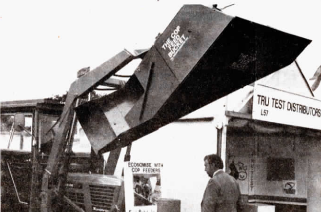
The Cop feed bucket attaches like a loader bucket to any tractor loader.