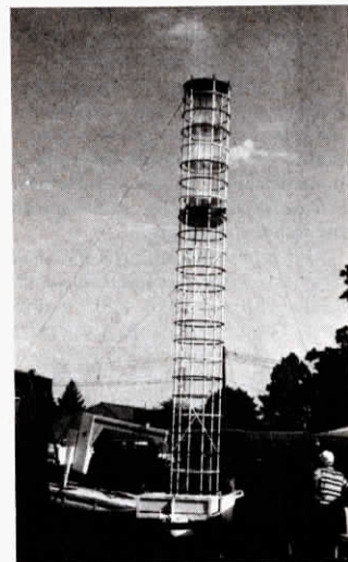
Barrel-shaped "Wind Mule" catches wind from every direction.

For more information, contact: FARM SHOW Followup, Cop Engineering, Somersal Mill, Doveridge, Derbyshire, England.