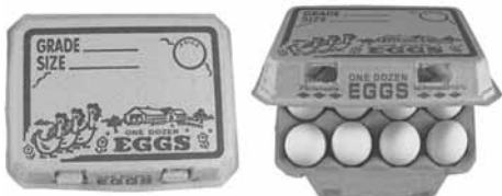
3 x 4 Egg Box, Vintage Style Item Number: FHP-34V

EggCartons.com offers a complete line of cartons along with everything you need to set up your own egg business.