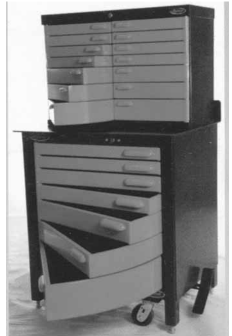
Toolbox drawers pivot out on a front corner to expose every square inch of space.

“We will soon be introducing a new cabinet similar in size to the Pro 20 that can be mounted on a truck or trailer bed for mobile shop work,” says Stuart. “A bottom hinged front cover will lower to reveal the drawers. The cover will provide a weather tight seal and will be lockable. When open, the unit will have a fully functional work surface.”