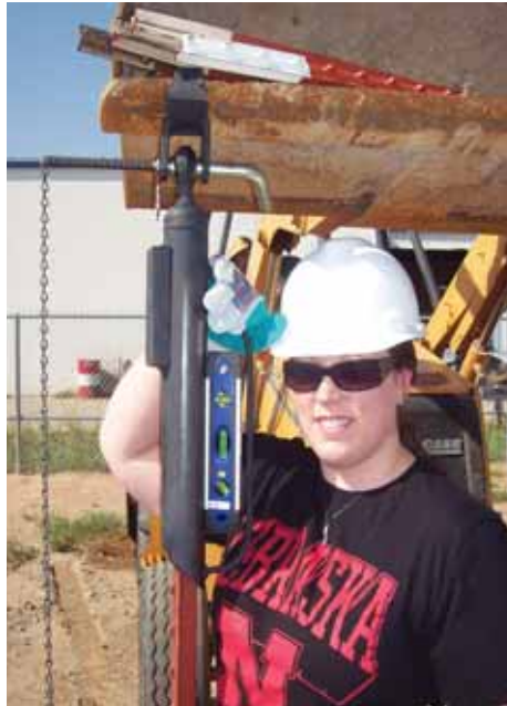
Tee-post driver hangs from loader bucket. Post slips into driver barrel, which swings freely on swivel, allowing gravity to align posts.

The Tee-Post Driver is priced at just $119.95 for the Driver 5 model. It attaches