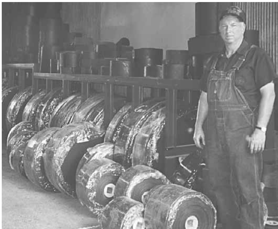
You can visit Hammond Equipment on the internet at www.balerbelts.com . All of the company’s belting is made in the U.S.

Contact: FARM SHOW Followup, Hammond Equipment, 31032 Ala Hwy 25, Faunsdale, AL. 36738 (ph 334 627-3348).