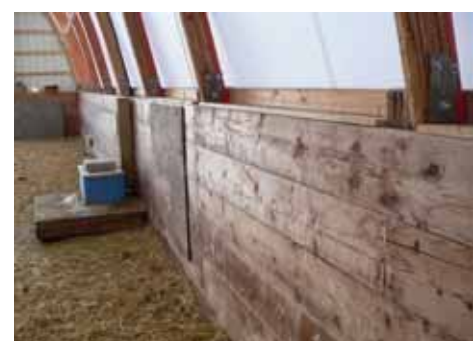
Wood hoop barns are available in 30, 36, 38, 40, 42 and 44-ft. widths, built to any length. Can be easily finished with end walls and doors.