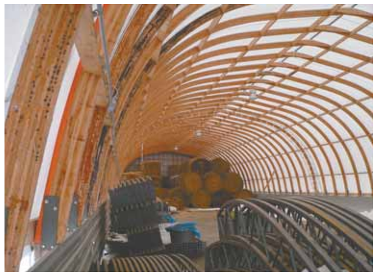
Silver Stream makes hoop barns with either steel or wood hoops. The advantage of wood is that it's easier to insulate and it can be tinned over at any time, if desired.