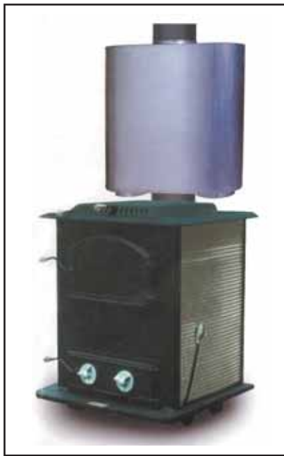
Heat Saver is designed to capture and circulate up to 40 percent of the heat that normally goes up the chimney. It’s made to fit 4 to 9-in. dia. stove outlet pipe.