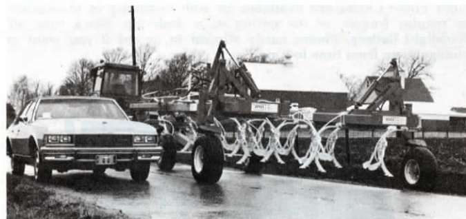
In transport position, rear-folded toolbar applicator is lower than height of the tractor. The 45 ft. wide unit folds to narrow, 15 ft. width.

You just pull two pins and drive the tractor forward to fold DMI's new inline-folding tool bar anhydrous ammonia applicator for transport. Available in 45 ft. and larger widths, it folds backwards to a narrow 15 ft. for down-the-road transport.