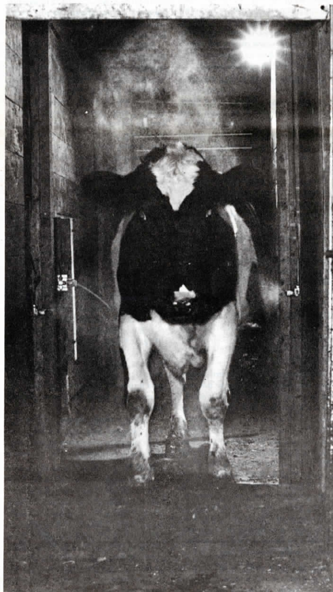
Better Built unit needs no electric or outside power source. Sprayer activates only when an animal passes through it.

For more details, contact: FARM SHOW Followup, Grand Island Automatic Sprayer Company, P.O. Box 1158, Grand Island, NB 68801 (ph. 308 382-7300).