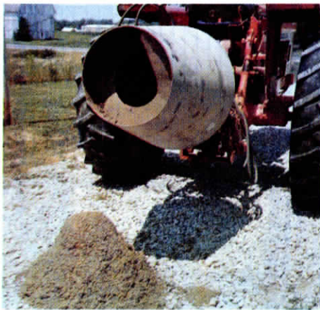
Self-dumping Rotamixer turns counter-clockwise to discharge mixed load.