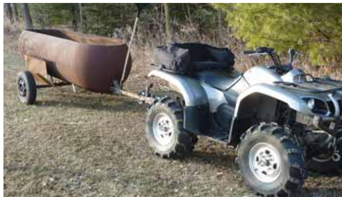
"It lets me burn brush and big tree branches in my yard without killing the grass," says Dave Kulzer, who built this mobile trash burner out of an old 500-gal. LP tank.

Contact: FARM SHOW Followup, Dave Kulzer, 30216 Co. Rd. 41, Albany, Minn. 56307 (ph 320 845-2306).