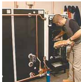
Imported "smokeless" wood boilers use the energy in wood 3 times more efficiently than traditional boilers, say manufacturers.

Other fuels such as wood chips, corn cobs, corn and coal can also be used. Heat generated by the boilers can be integrated into a hot water heating system or a forced air system using a heat exchanger.