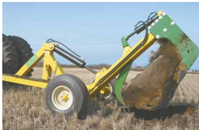
Hydraulically-operated Bergen rock picker forms a 3-point grip around rock and then pulls it up and out of the ground.

Contact: FARM SHOW Followup, Bergen Industries, Box 133, Drake, Sask., Canada S0K 1H0 (ph 306 363-2131; www.bergenindustries.com).