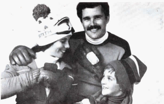
"Noseys" are small absorbent pads that stick to the back of mittens.