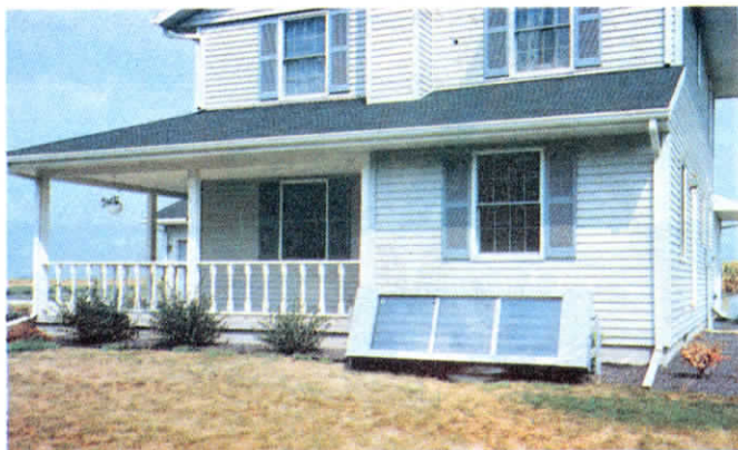
Solar panel mounts on a swivel which allows Grieder to rotate it as winter progresses.

“SAVES $100 TO $200 PER YEAR ON HOME HEATING BILL”