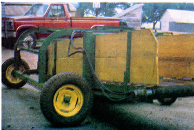
Conveyor and pickup head are individually driven by hydraulic orbit motors.

Contact: FARM SHOW Followup, Byron Gutz, RR 2, Box 140, Osmond, Neb. 68765 (ph 402 748-3706).