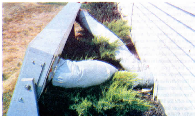
A pair of 8-in. dia. insulated flexible ducts run into house through basement window, carrying hot air from the solar panel to the regular home heating ducts.

Grieder sells plans to build the solar panel. Contact: FARM SHOW Followup, Dave Grieder, Rt. 1, Box 11, Carlock, Ill. 61725.