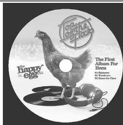
The soothing tempo of classical music has a positive effect on poultry, says a California-based company that has created a CD for hens.

Contact: FARM SHOW Followup, the happy egg co (ph 415 795-2041; www.thehappyeggco.com ; contact@thehappyeggco.com ).