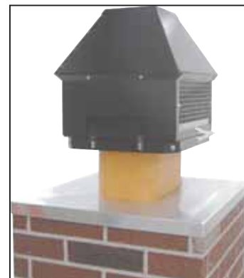
Tjernlund auto-draft inducers keep smoke moving up and out of wood-burning fireplaces. Models are available to fit into flues or on top of chimneys.