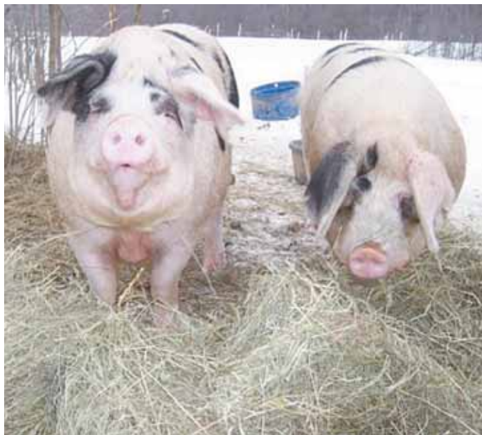
Gloucestershire Old Spots pigs are easy to work with and have high body fat so they thrive outside, even in winter.

"Members can get instant results telling