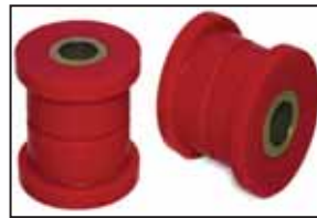
Dodge Track Bar Bushing Kit 2003-2007.5