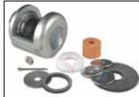
Dodge Track Bar, Tie Rod End Kit 1994-2007.5

With truck on ground, wheels straight ahead, unlock steering wheel (do not start engine). Have someone rock steering wheel left and right hard while you look at each end of track bar as well as all 4 tie rod ends for any up and down movement. If there is any, you know this is causing play in the steering.