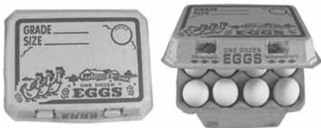
3 x 4 Egg Box, Vintage Style Item Number: FHP-34V

EggCartons.com offers a complete line of cartons along with everything you need to set up your own egg business.