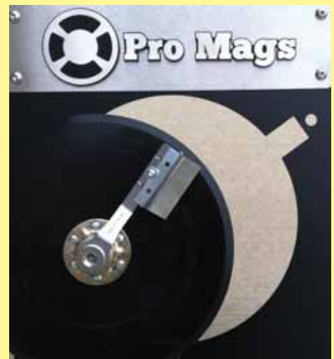
Universal scraper bolts onto the axle of any planter's opening disc.

The scrapers sell for $39.99 apiece plus S&H. "The mounting body is a one-time purchase, and there is only the scraper blade to replace over time as it wears," says Hesla.