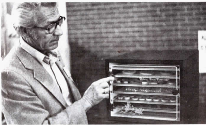
Different fruits and vegetables can be dried at the same time, as distributor Classen points out.