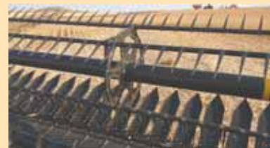
How To Harvest Corn Without A Cornhead (Page 19)