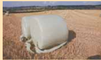
Plastic Wrap Protects Straw Bales, Tool (Page 5)