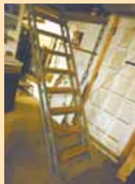
“Easy Up” Shop Ladder (Page 36)