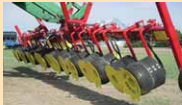
Rubber-Tired Weed Puller Is Back! (Page 40)