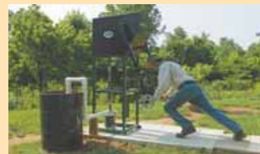
High-Capacity Hand Pump (Page 17)