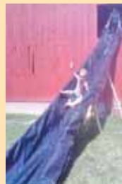
30-Ft. Long Hay Mow Slide (Page 41)