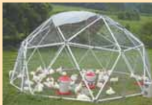
“Zip Tie” Chicken Dome, Greenhouse (Page 30)