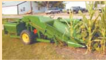
He Built His Own Corn Picker (Page 2)

To Subscribe, Go To www.FARMSHOW.com (Or Use Order Form On Page 44)