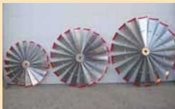
Kits To Restore Old Windmills (Page 27)