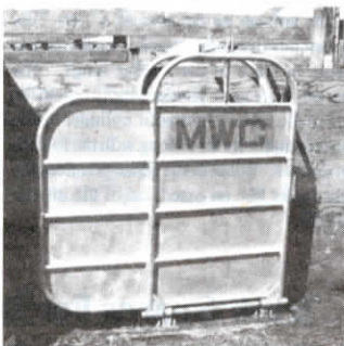
Calf cradle mounts up against a solid wall (above). Once calf's inside, cradle drops flat to the ground (top).