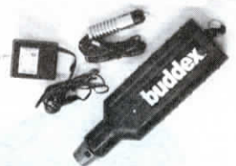
Dehorner cuts off blood flow to horn bud, preventing growth. Heats instantly to 1,500° when activated.

The 5/8-in. dia. spring-loaded wire ring on the hot cutting tip instantly heats up to